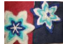
Cookie Cutter Ornaments

Enlarged class photos can be found on our website!