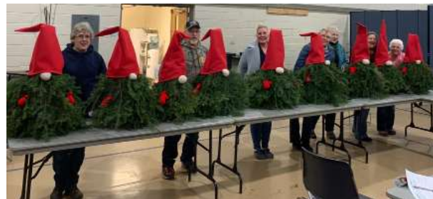
Photo: PVAEC Giant Balsam Gnome Class