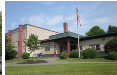
Dover-Foxcroft Penquis Higher Ed Center (PHEC) 50 Mayo Street, D-F