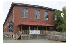
Dexter Dexter Learning Center (DLC) 16 Church Street, Dexter

Come see us at a Learning Center near you!