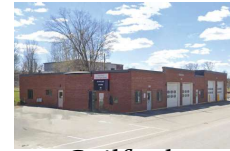
Guilford Guilford Fire Station (GFS) 4 School Street, Guilford ME