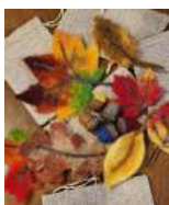
Leaves & Acorns

Wednesday 10/2 9am-12:30pm or 5:30-9pm $40