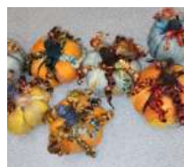
The Great Pumpkin