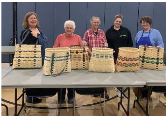
Photo: PVAEC Farmers Market Basket Class

In this class, we will learn how to make holiday wreaths. We will use balsam and also decorate it with other beautiful branches from white pine and cedar. We will use a 12" ring to make this balsam wreath. We will also go over how to make holiday swags and garland. $50 Tuesday 12/3 5-7pm PHEC