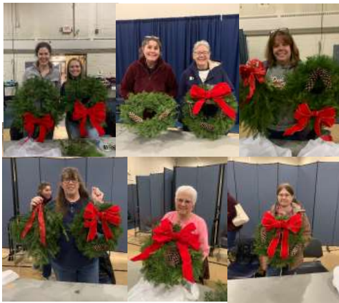
Photos: PVAEC Balsam Wreath Students

In this class, we will learn how to make three homemade gifts from natural items. These are wonderful gifts to continue to make and perfect for the holidays! Who loves Gnomes? In this class, we will make Giant Holiday Gnomes out of balsam, fir and white pine while using the framework of a tomato cage. To finish them off, we will add a nose and large holiday hat. These Gnomes will be about 3' high and perfect for your holiday season. We will also make smaller gnomes that can be a holiday decoration or used for a cork stopper in your holiday wine. They are very cute for that small holiday gift. Finally, we will learn how to collect and process balsam for your own balsam fir bags/pillows. In most gift shops here in Maine we sell the fragrance of the wilderness. Another perfect gift for yourself or a loved one. $60 Tuesday 12/10 5-8pm PHEC