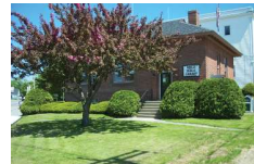
Milo Milo Free Public Library 4 Pleasant Street, Milo ME