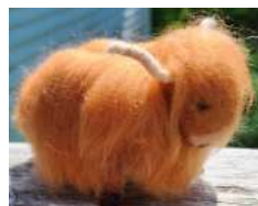
Moo the COO!